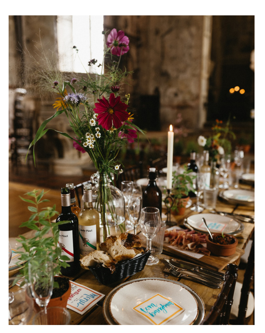
Chloe Mary Photo